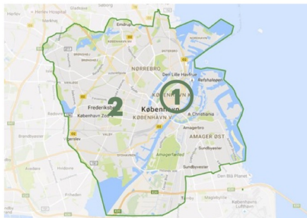
Zone 1: 7.500 invitations / Zone 2: 2.500 invitations

Invitation to 10.000 Copenhageners by "e-boks" / electronic mailbox for individual citizens (not households)