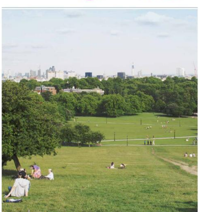
THE LONDON PLAN SPATIAL DEVELOPMENT STRATEGY FOR GREATER LONDON